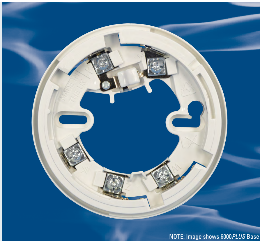
NOTE: Image shows 6000PLUS Base

The Protec 3000PLUS and 6000PLUS standard base are designed for use with either the Protec 3000PLUS or 6000PLUS series fire detection devices. It allows the detectors to be mounted directly to any flat surface, or BESA box. Provision is also made for surface mount trunking entry via side breakouts.